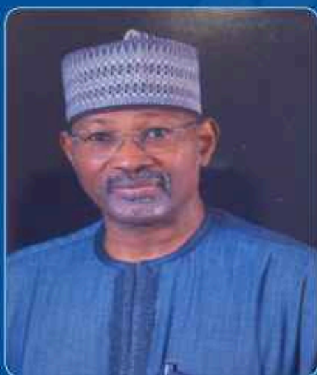
PROF. ATTAHIRU M. JEGA, OFR CONSULTANT

Professor Attahiru Muhammadu Jega was the Chairman, Independent National Electoral Commission (INEC), Nigeria, between June 2010 and June 2015, during which time he presided over the preparation and conduct of the widely acclaimed 2011 and 2015 general elections.