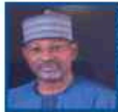
1. Prof. Attahiru M. Jega Consultant, CAEEP Professor of Pol. Sci, BUK Kano, Nigeria

Over the years, the Institute has many seasoned professionals, academic, and experts in different areas who have been delivering in our courses. So, these include: